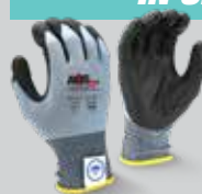
RWGD105 Cut Protection Work Glove

RADIANS OFFERS MANY WORK GLOVES IN SIZES RANGING FROM XS-2XL