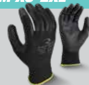
RWG19 Touchscreen Work Glove