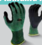
RWG538 Cut Protection Work Glove